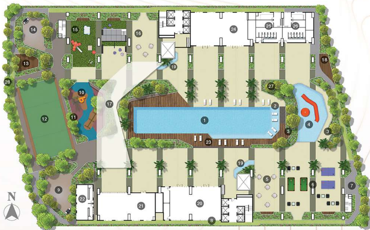
PODIUM LEVEL 7