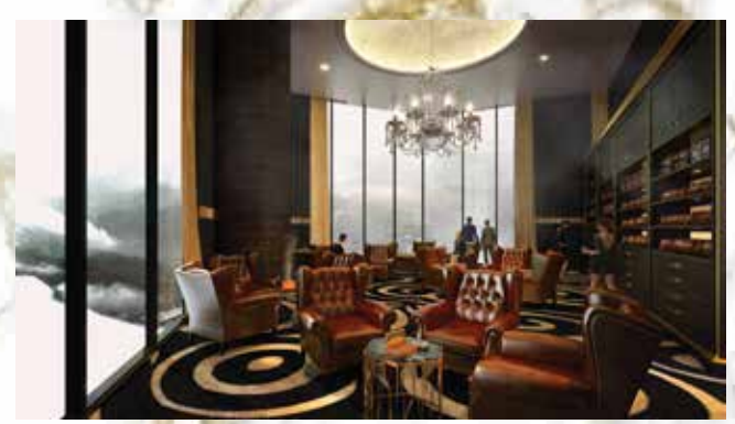
LEVEL 13 CIGAR LOUNGE 雲茄星