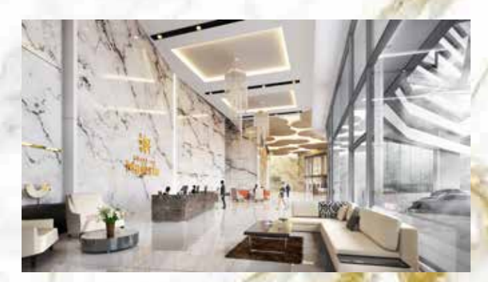
LEVEL G GRAND LOBBY 接待大堂