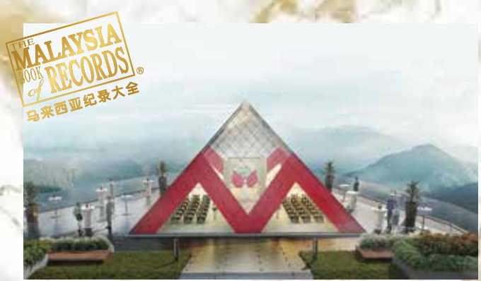
ROOF TOP HIGHEST ALTITUDE GLASS HOUSE 空中花园