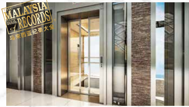
GROUND FLOOR - LEVEL 50 HIGHEST ALTITUDE CLEAR GLASS SKY LIFT 透视玻璃升降机