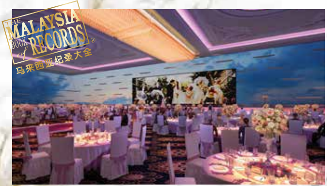
LEVEL 50 HIGHEST ALTITUDE LARGEST BANQUET HALL 空中宴会厅