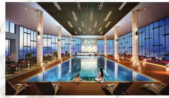
LEVEL 50 LUXURY SKY POOL 空中泳池