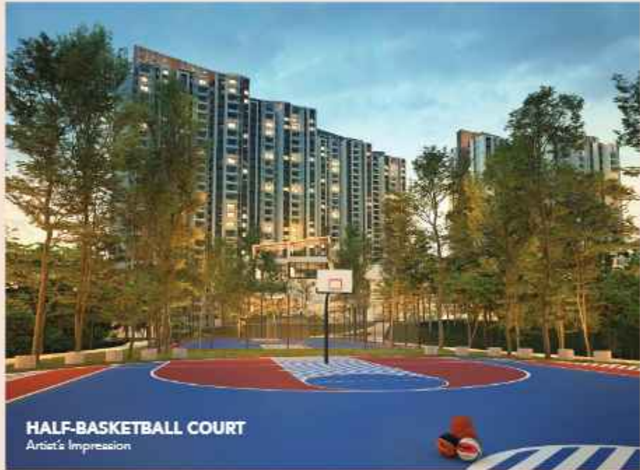
HALF-BASKETBALL COURT Artist's Impression