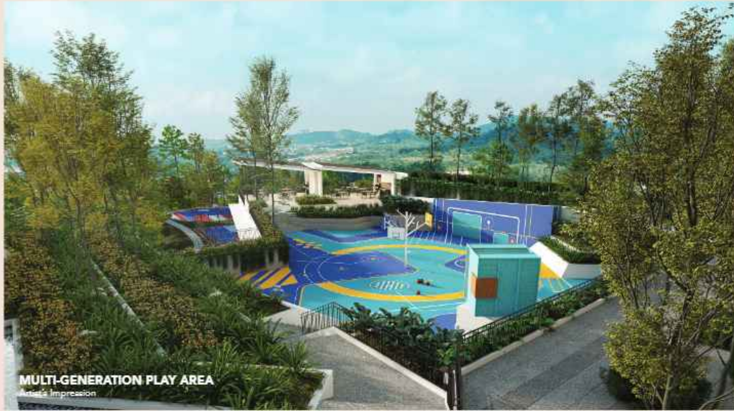
MULTI-GENERATION PLAY AREA Artist's Impression